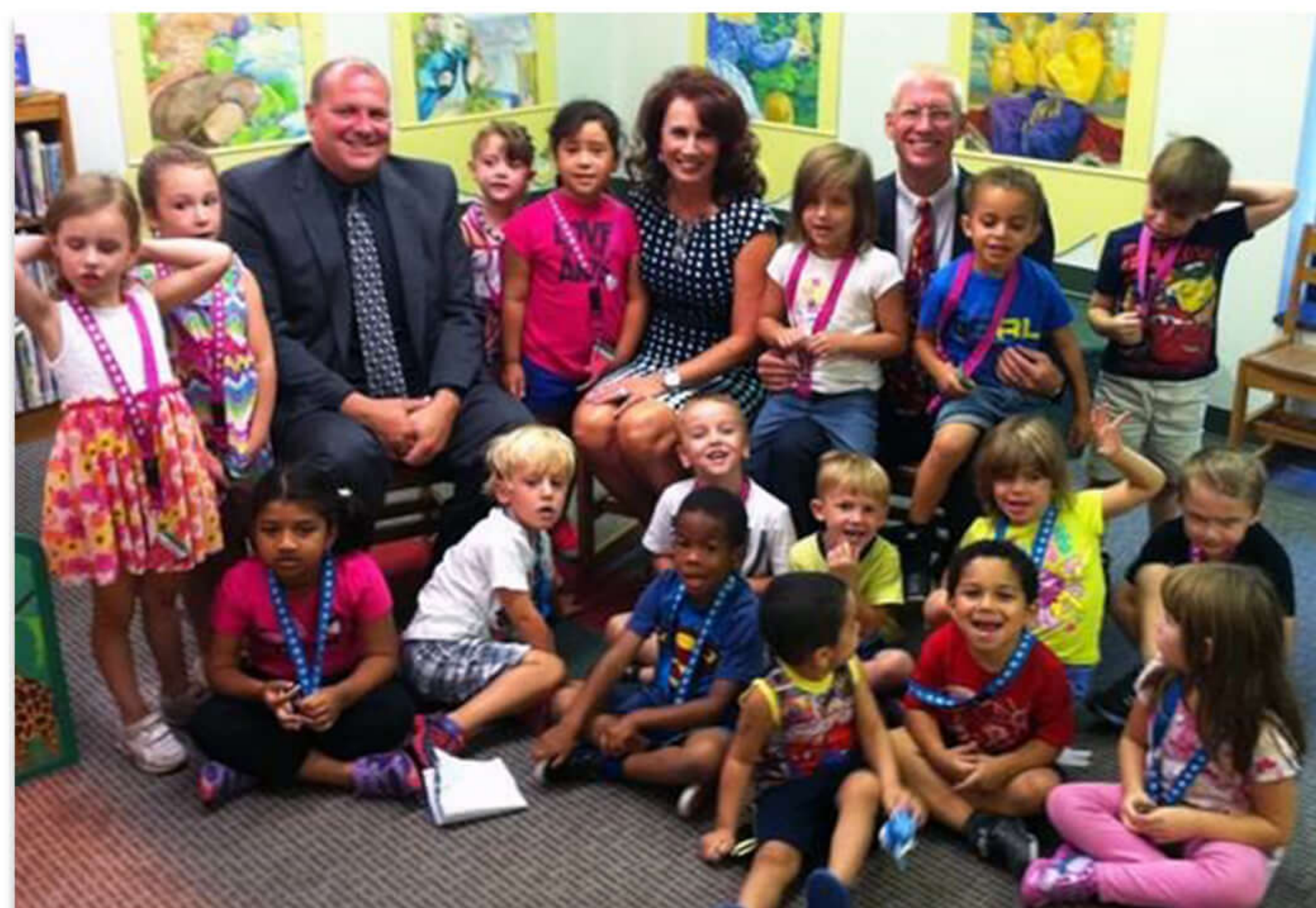
United Way of Wyoming Valley

Dolly Parton's Imagination Library puts books into the hands and hearts of children across the world. We partner with local communities to provide a specially-selected, age-appropriate, high-quality book each month to registered children from birth to age five. These books are personalized with the child's name and mailed directly to the child's home to create a gifting experience that makes books exciting and shows the child someone is thinking of them.